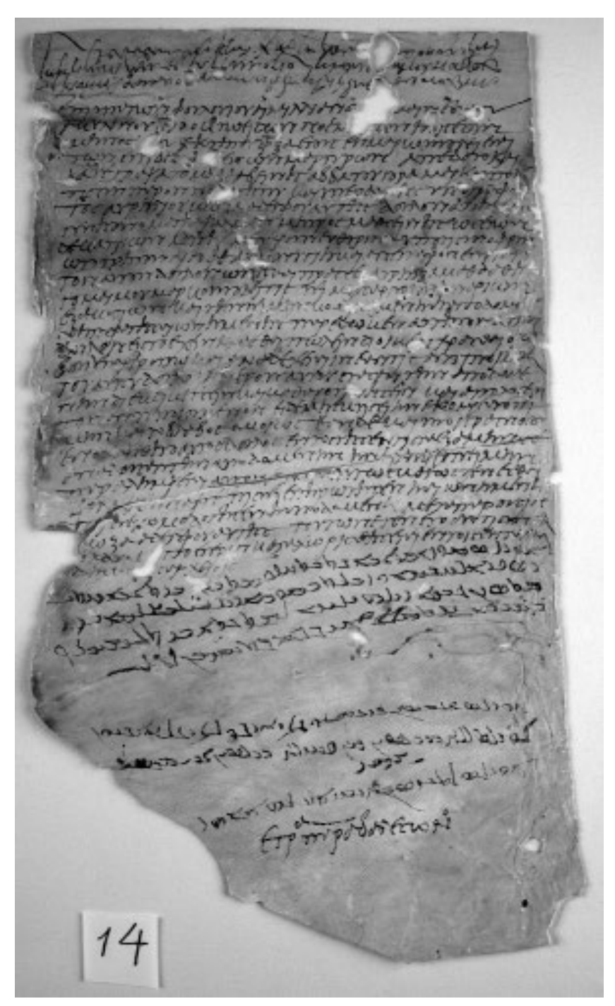
Figure 14.1 P. Euphr. 6r